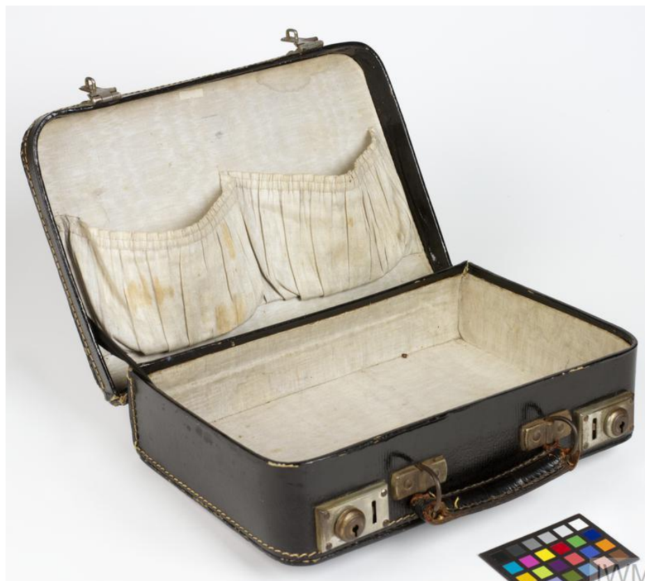
A doll, a dress, a winter coat.